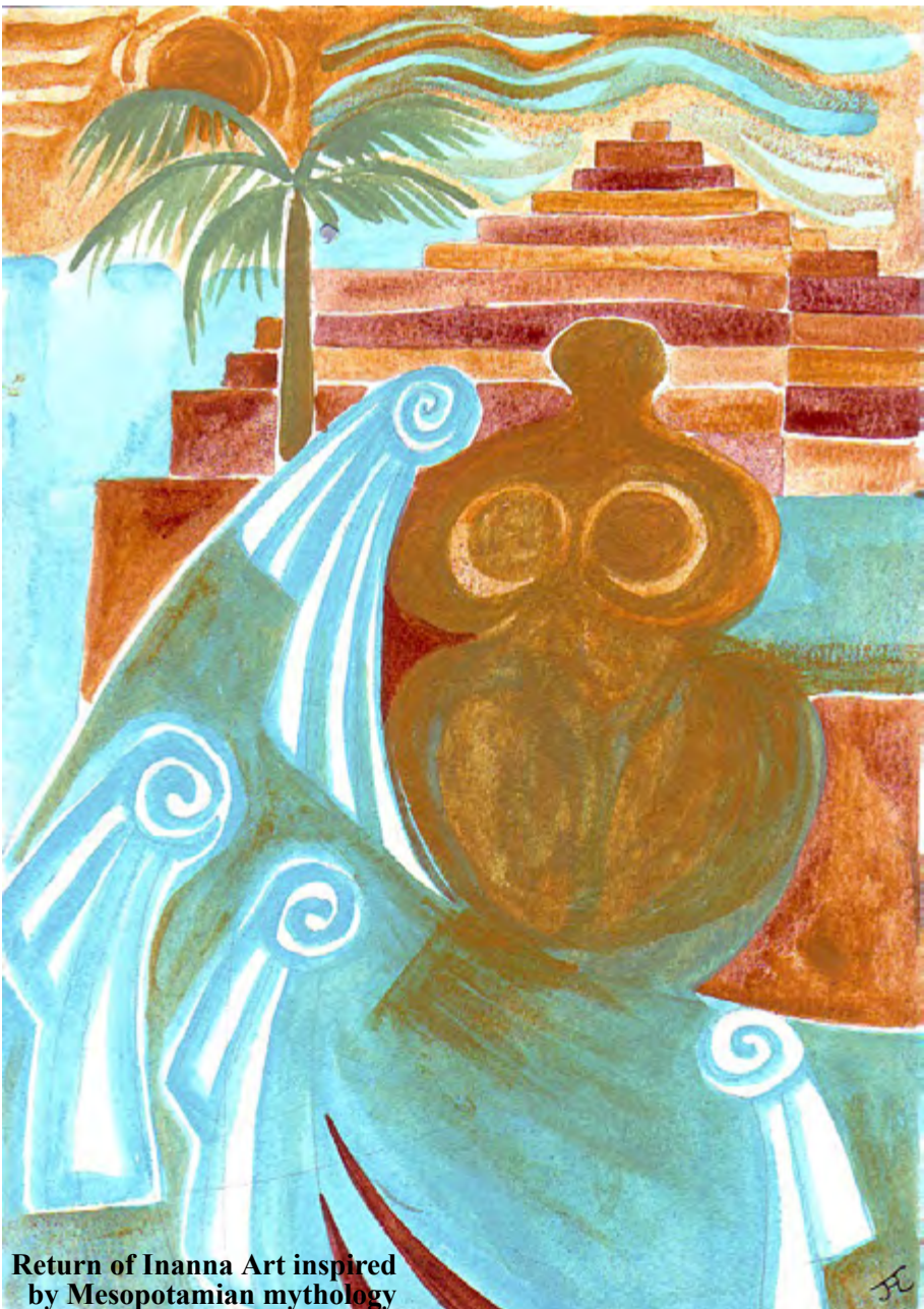
Return of Inanna Art inspired by Mesopotamian mythology