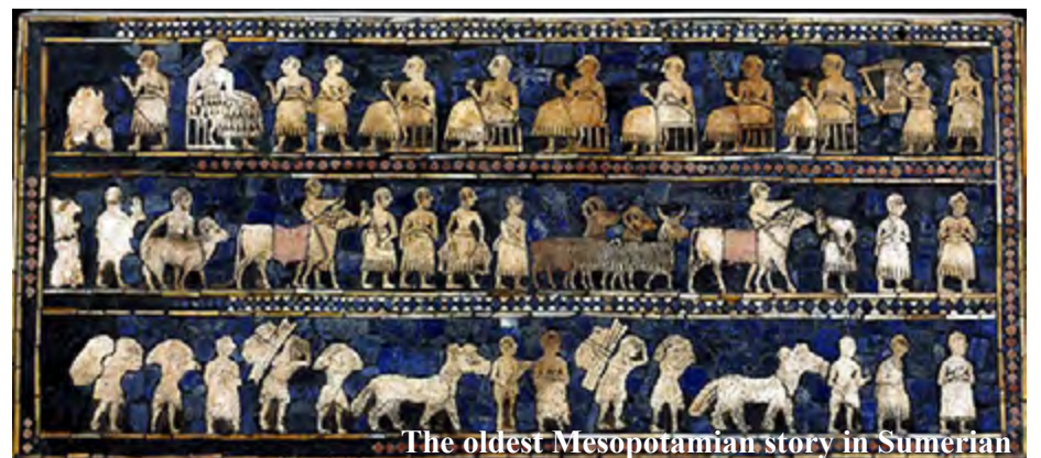
The oldest Mesopotamian story in Sumerian